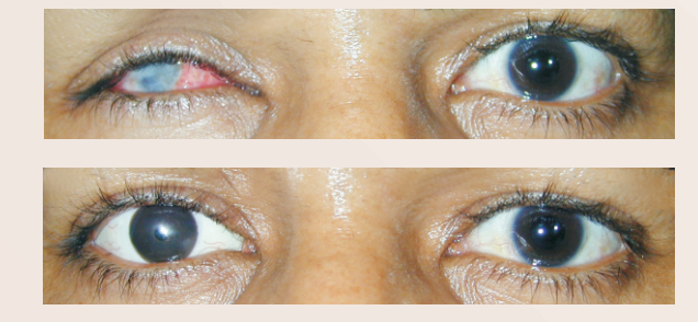
The loss of an eye no longer has to mean the loss of a natural appearance

Aravind Ocular Prosthetics Centre was established in 2004 and is now one of the leading centers in India for custom fitting of artificial eyes. Since inception, the centre has fitted artificial eyes to over 1500 satisfied customers.